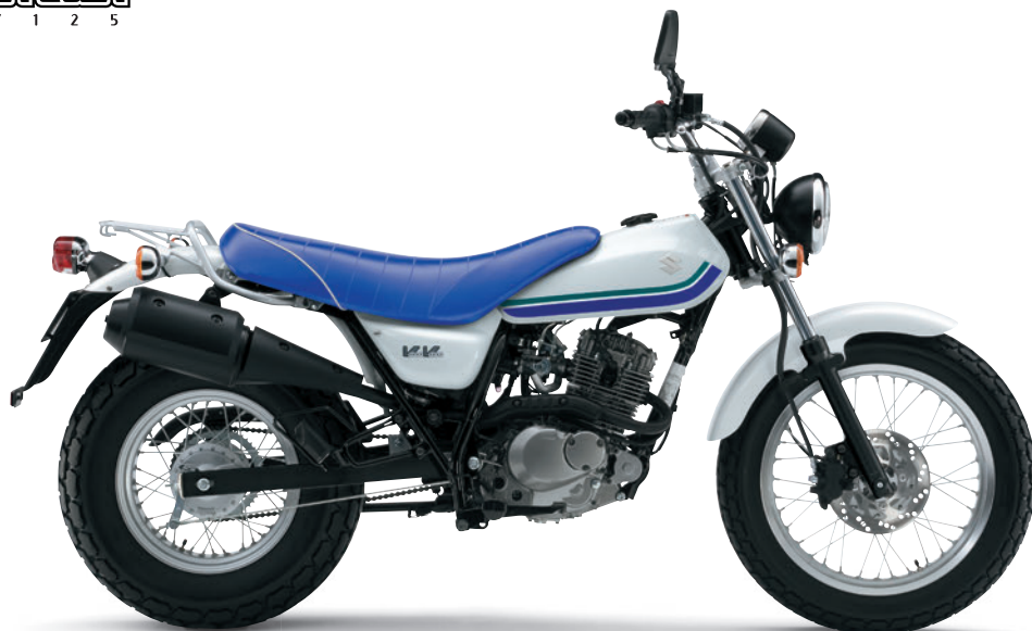
Glass Splash White (YBD)