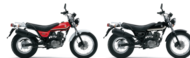
Pearl Mira Red (YVZ)