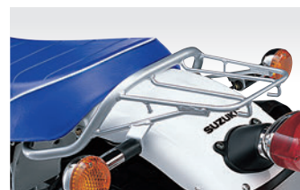
Grab bar / luggage carrier